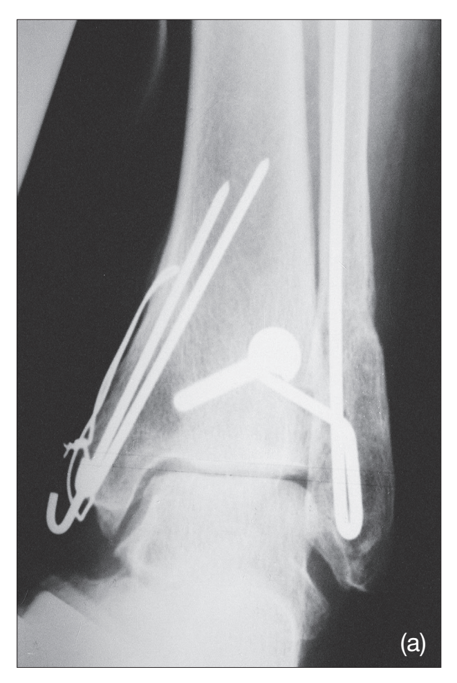
Figure 5. Post-operative AP (a) and