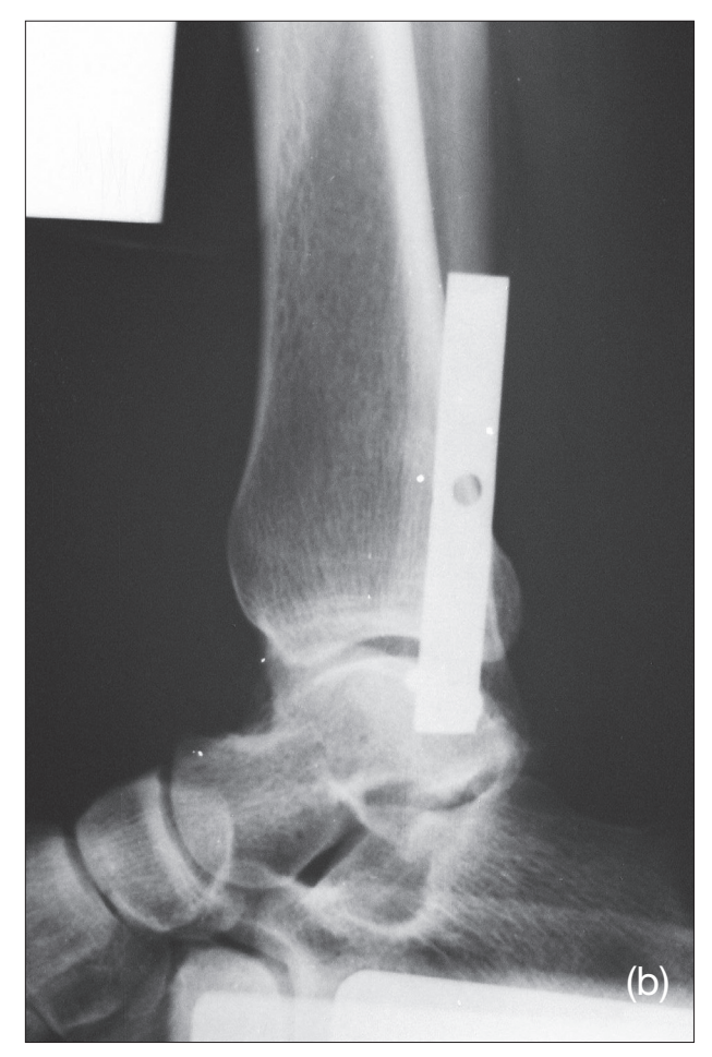
Figure 3. Post-operative lateral (b) radiographs of the patient after 45 months. Internal fixation with plate and screw was used for lateral malleolus. The ruptured deltoid ligament was repaired. A supplemental syndesmotic screw was inserted and removed later on, of which the empty hole

of the tibia and the lower tip of the fibula) on both injured and uninjured ankles. Fibular shortening was evaluated immediately post-operatively and at the last follow up visit and compared Fisher exact test. Mean surgical times were calculated for each one of these two procedures and compared statistically.