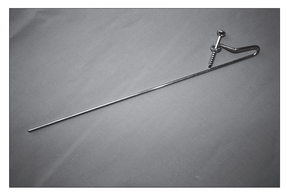
Figure 1. The ANK nail.

first 24 hours by five senior surgeons using whichever technique they preferred except comminuted fractures.