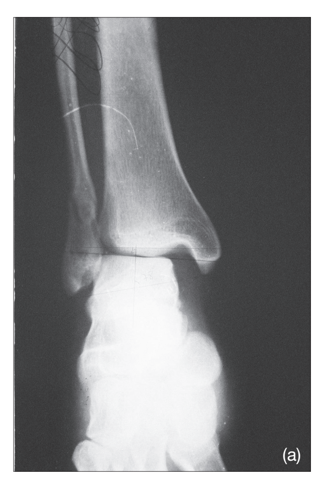
Figure 2. AP (a) and