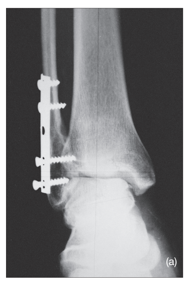
Figure 3. Post-operative AP (a) and