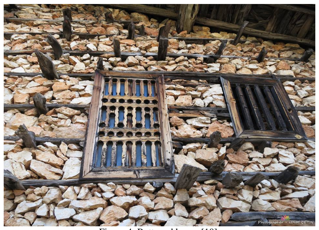
Figure 4. Buttoned house [10].

As shown at Figure 3 and 4, Houses' windows can be carved wooden cage, pinwheel* design shutter wood carving samples can be used as decorating. There is extensively the use of wood for decoration in the rooms and ceiling sofas [9].