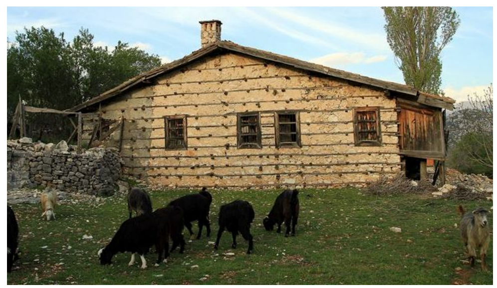
Figure 1. Buttoned house [10].