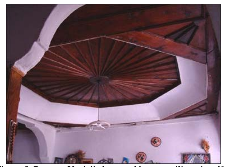
Figure 5. Durmus Yazici's buttoned house, ceiling view [9].

**Veil: It is the shelf above the stove and side eyes.