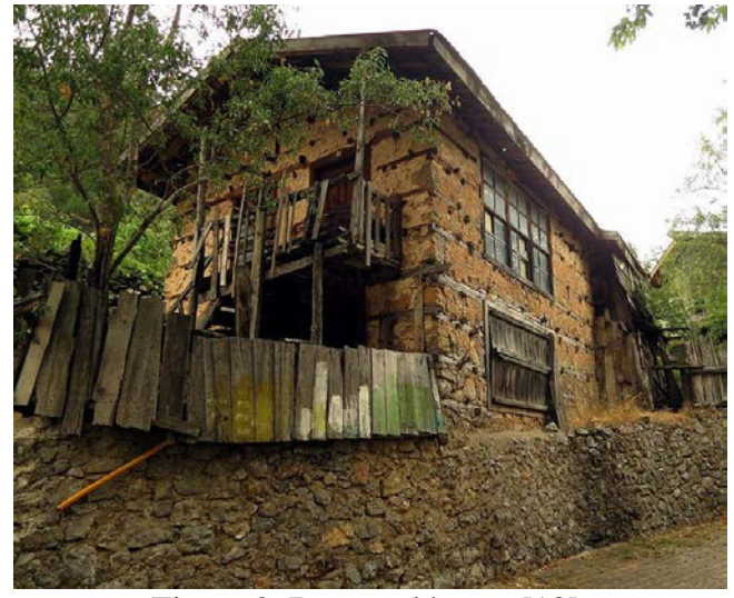
Figure 2. Buttoned house [10].