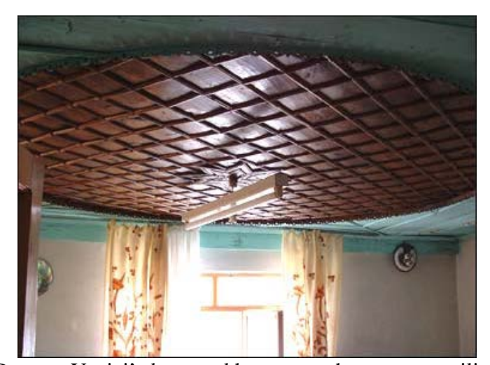
Figure 6. Durmus Yazici's buttoned house, southeast room ceiling view [9].