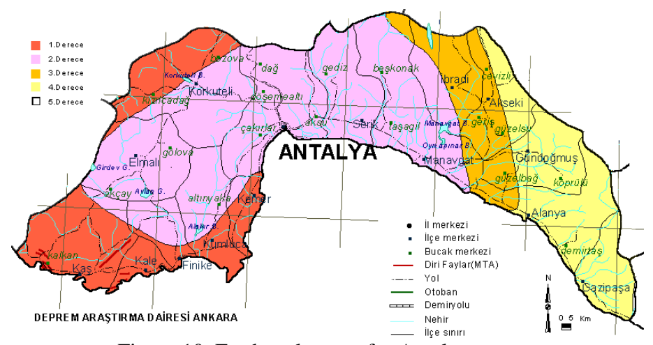
Figure 10. Earthquake map for Antalya.

The biological factors that cause deterioration of wood are bacteria, mushrooms, insects, marine creatures, birds and mammals. Besides, algae, moss and lichen are also harm [5]. The effects of the mushrooms and insects are the most observed biological effects. Bacteria and fungal effect causes discoloration and decay [4].