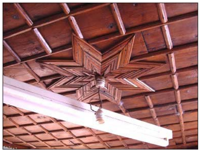
Figure 7. Durmus Yazici's buttoned house, southeast room ceiling detail [9].