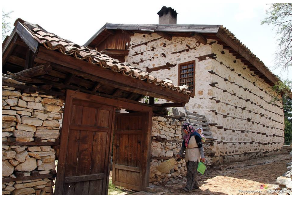
Figure 3. Buttoned house [10].

Wood is also used in parts such as pergola, place for ablution and rest room. Besides, it is seen that there are the round beams made of spruce in sofa cover. Again, houses' roof tree, terrace, door and window profiles are fully made of wood. Tar denominated trees were preferred for the interior architecture such as ceiling, closet, hood fume, door, room, shelf systems and terraces [3].